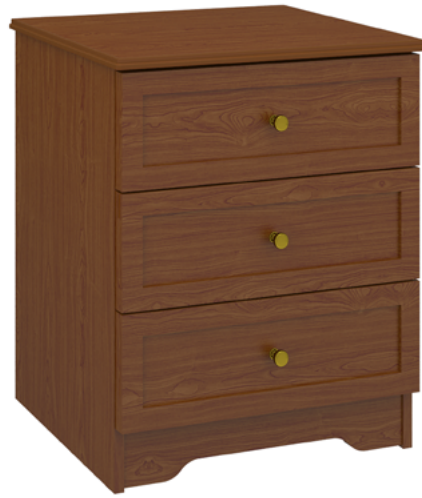
Model: LACH30 25W 19D 30H

The Lancaster Collection offers unobtrusive refinement and skilled craftsmanship to form the perfect balance between function and beauty. Rich OG detailing on the tops and recessed insert panels set into chamfered frames on doors and drawers. Collection available with or without contrasting edges as well as custom color combinations.